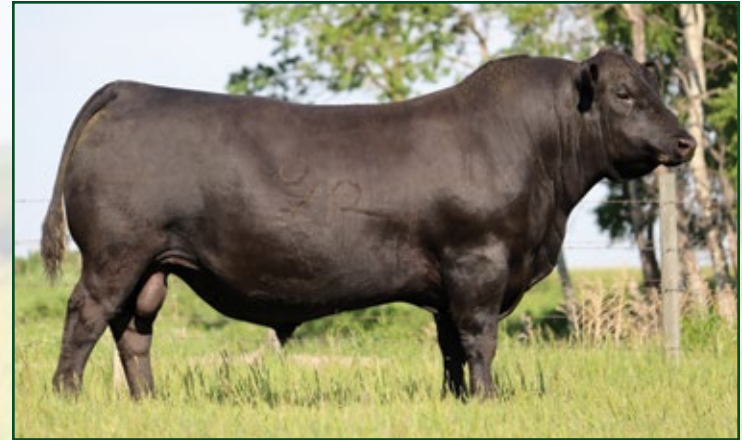
Reference COLEMAN JOHN WAYNE 906 Sire 2185556 IMP 0906G January 24 2019