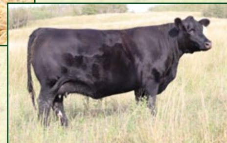
Dam to Lot 9

Leadoff Refresh son. Sale feature. Breed legends, Final Answer, Renown, Charlo, Chisum, CashFlow all represented in this fancy fella. Sure to crank out awesome females. Suitable for heifers. Mother might be our best young cow.