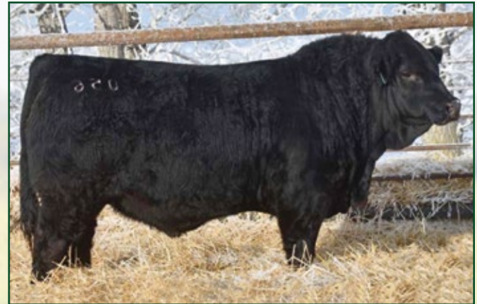
Reference JL REFRESH 0063 Sire 2152718 JLMB 63H February 03 2020