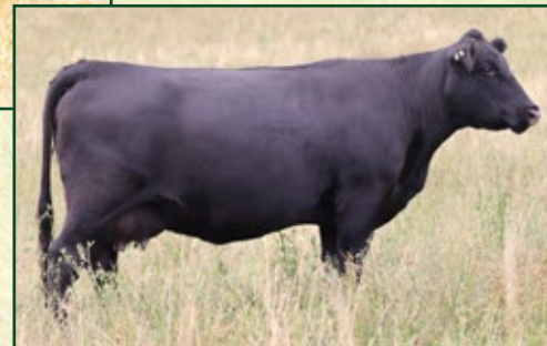
Dam to Lot 2