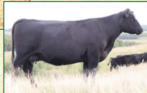
Dam to Lot 1

Sale feature John Wayne son is a real eye catcher. Mother is a tremendous young bull mother with an impressive full brother to 56L in the pen for next year. Low birth, high performance.