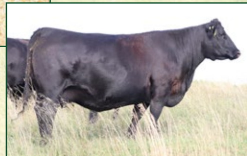
Dam to Lot 10

Refresh from an impressive Coalition daughter from the Annie K cow family. No holes calving ease bull suitable for heifers.